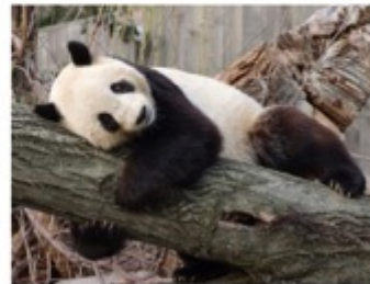
Smithsonian National Zoo